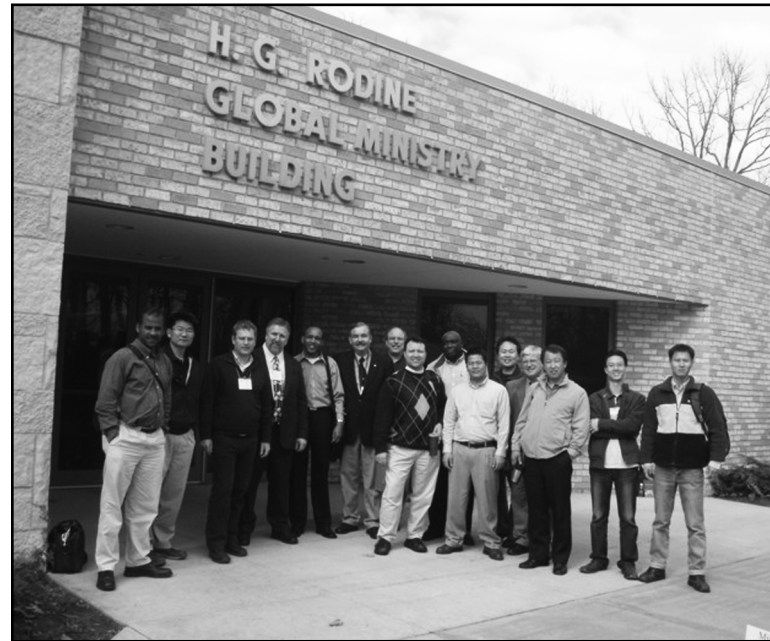
CTS Ph.D. students at the Missiology Conference