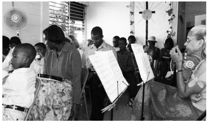
Congregation in worship

In the Church, we have seen remarkable changes and many are still coming in to worship every passing Sunday, though some had been worshipping at times in the past but stopped coming. We shall resume Bible Study Class in Portmore this year and we believe God for greater works in other regions as He leads us.