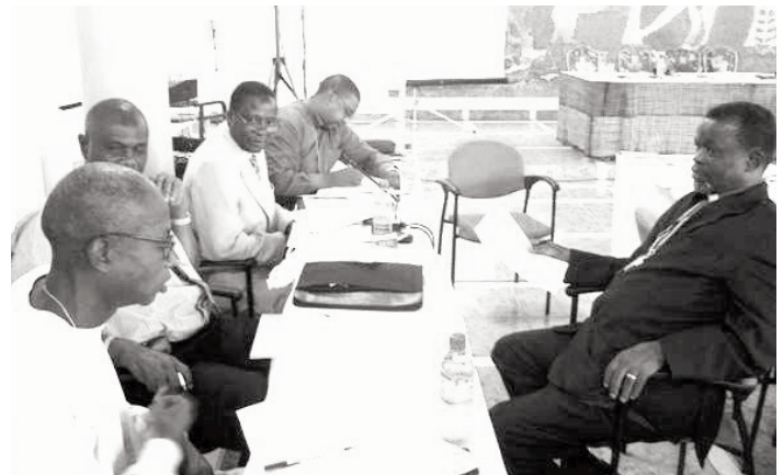
Representatives from English speaking Africa meet for a small group session.